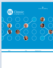
DiSC Classic Paper